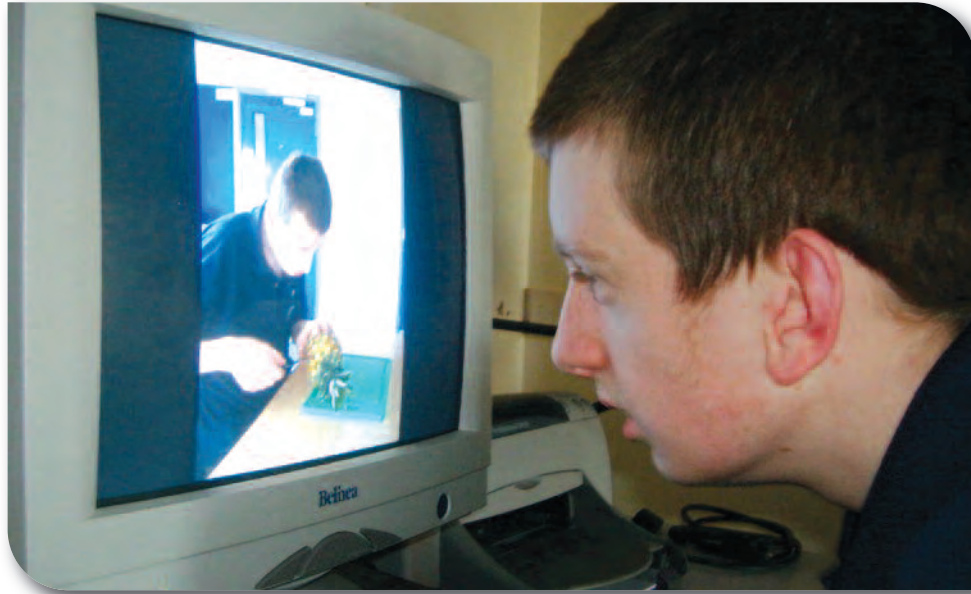
Choosing photographs for a review