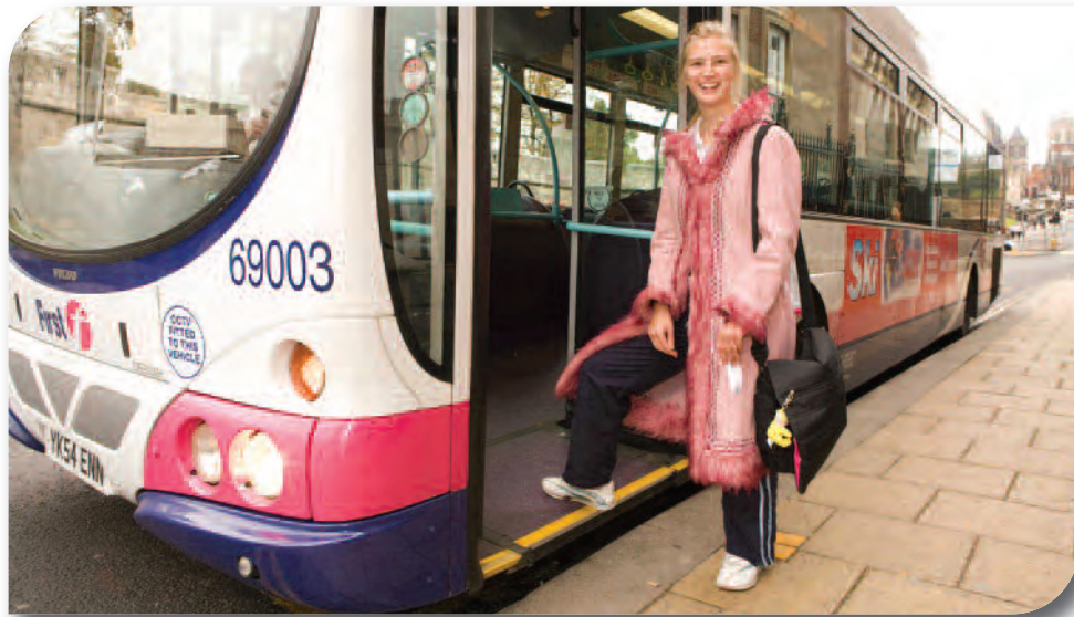
Learning to travel independently