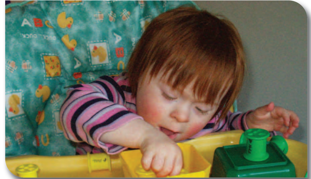
Photographs and comic strips can be used to share what children like to do with others

UN Rights of the Child Article 12 www.unicef.org.uk